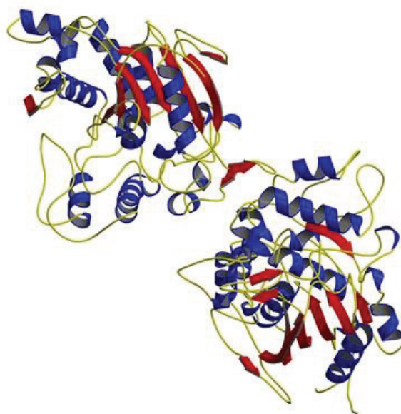
Figure 2. 3-D structure of Bacillus stearothermophilus (Tyndall et al. 2002).

Glycosylation is an important feature of eukaryotic lipases, a distinct characteristic of the higher order. Glycosylation is known to contribute to the stability of lipase, but does not affect the enzyme activity (Isobe and Nokihara, 1993). Glycosylation of only a few lipases are reported to due the complexity of its elucidations. However, recently, a number of techniques have evolved to analyse the structural aspects of glycosylation. A strategy for the identification of site-specific glycosylation in glycoproteins using MALDI-TOF mass spectrometry has been described (Mills, 2000). Also, Dell and Morris (2001) have reviewed the various mass spectroscopic techniques as applied for the determination of glycoproteins. More recently, infrared spectroscopy has been used to evaluate the glycosylations of proteins, showing distinct absorption bands for the sugar moiety, the protein amide group and water (Khajepour et al. 2006). Tang et al. (2001) have reported that glycosylation conferred thermostability to the lipase, while, it did not have any catalytic effect, concluding that glycosylation