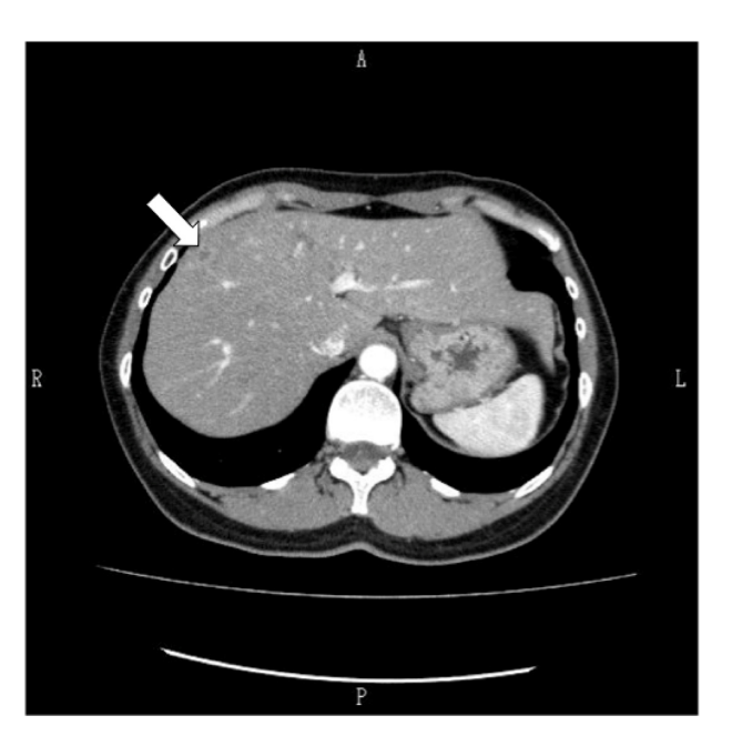
Figure 3. Follow-up enhanced abdominal CT findings of a 46-year-old woman with fascioliasis after 1 year of treatment. The multiple nodular cysts observed at admission are almost no longer visible (the white arrow).

fascioliasis. Therefore, the disease can sometimes be excluded from differential diagnosis and overlooked.<sup>6,7</sup>