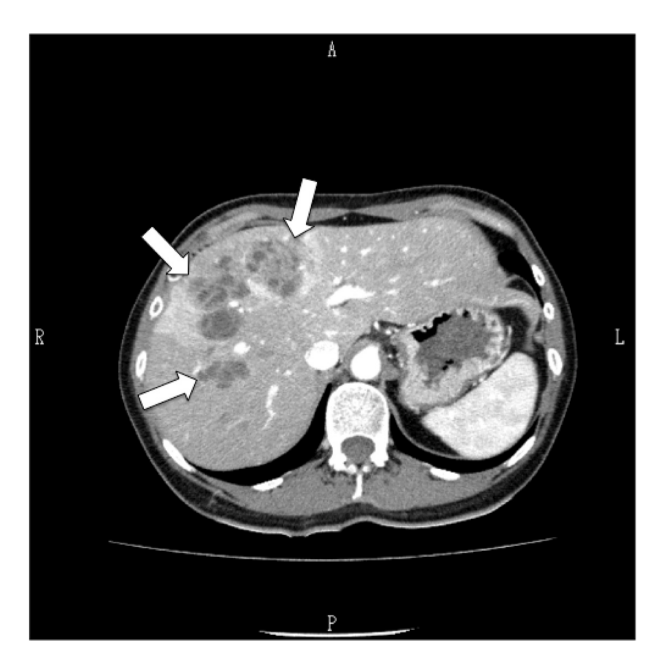
Figure 1. Enhanced abdominal CT findings in a 46-year-old woman with fascioliasis on admission. The white arrow shows multiple nodular cysts with tubular branching.

For treatment, 500 mg (10 mg/kg) triclabendazole (Egaten<sup>TM</sup>, Novartis Pharma AG, Switzerland) was orally administered two times at 12-h intervals. After the initiation of triclabendazole administration, the fever and malaise resolved immediately. Her eosinophil count decreased to 1,966/ \mu L in 1 month, 624/ \mu L in 2 months, and 273/ \mu L in 3 months, reaching the normal range. Contrast-enhanced CT performed a year later showed almost complete disappearance of the multiple nodular lesions (Fig. 3).