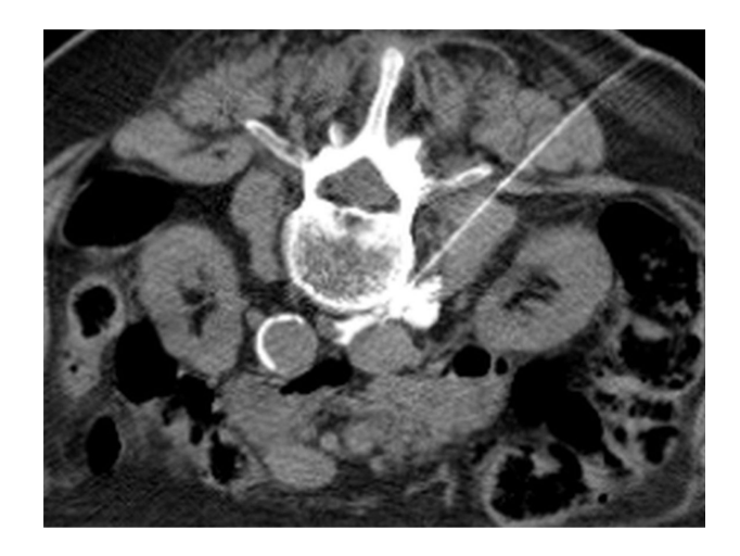
Figure 2. A CT scan in the case of right-sided lumbar sympathicolysis: intercavovertebral positioning of the puncture needle and distribution of the sympatholytic agent.

Near-infrared spectroscopy. Near-infrared spectroscopy (NIRS) is a non-invasive optical method for measuring tissue oxygenation. Detection is conducted in the near-infrared range at a wavelength of 700–1300 nm. The change in the absorption spectrum of hemoglobin (Hb) in relation to the level of oxygenation is used to measure regional oxygen saturation. If there is an increase in focal