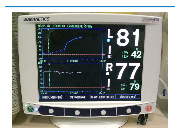
Figure 3. Monitor unit of the INVOS 5100C.