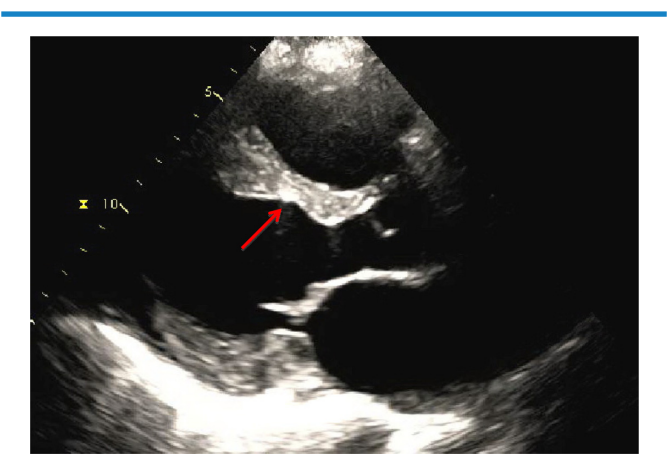
Figure 1. Echocardiogram, parasternal long axis view, of a 33-year-old patient with CS. Note the thinned, notched aneurysmal segment in the basal anteroseptal wall (red arrow).

treatment with corticosteroids.<sup>28</sup> The sensitivity with <sup>99m</sup>Tc appears superior to <sup>201</sup>Th (65% vs 46% in one direct comparison study).<sup>28</sup> Both appear quite specific, with one study reporting 100% specificity when comparing <sup>99m</sup>Tc radionuclide studies