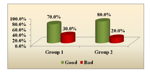
Figure 1. Graft uptake in both groups.

popularized by William House. This procedure attempted to avoid the common problems with radical mastoidectomy.<sup>6</sup>