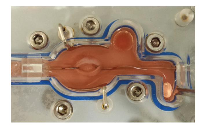
Figure 1. A bioengineered smooth muscle tissue in an organ bath for testing physiological functionality.

properties of the rings were determined at days 8 and 14 post-formation.<sup>46</sup> The ultimate tensile strength and ring stiffness were found to be higher in larger rings but decreased as a function of time. However, functionality of the smooth muscle was not evaluated. A correlation between the different mechanical properties of the different ring sizes and the force generated from the smooth muscle is an important factor that needs to be determined in tissue regeneration.