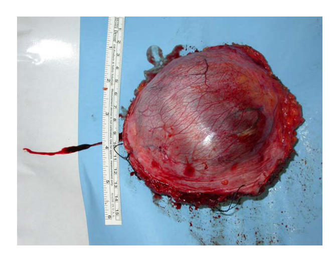
Figure 3. Resected mass.

The present case report signifies the likelihood of manifestation of a DT as a growing mass in anterior abdominal wall in the post-partum period, following cesarean delivery in a female patient. This can be a unique example in which pregnancy triggers the initial development, while the subsequent growth occurs under relatively hormone-free period such as puerperium.