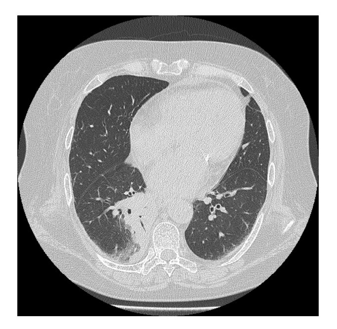
Figure 1. Day 0. Computed tomography of the chest. Air bronchogram showing consolidation and ground glass opacity (GGO) extending to the right S6, S9, and S10 segments of the lungs.

After discharge from our hospital, we confirmed her seroconversion of L. pneumophila and complete healing of pneumonia on chest CT. MTX (6 mg/week) and PSL (5 mg/day) therapies were then restarted without ADA because of an increase in her RA disease activity at day 20. However, pneumonia relapsed at day 55 along with loss of appetite, fatigue, and coughing. Laboratory data showed acute inflammation (CRP, 13.09 mg/dL; white blood cell count, 10,500/mm<sup>3</sup>), and her urine L. pneumophila antigen test (Binax) was again positive. In addition, both her serum KL-6 and beta-D-glucan levels were high (815 U/mL and