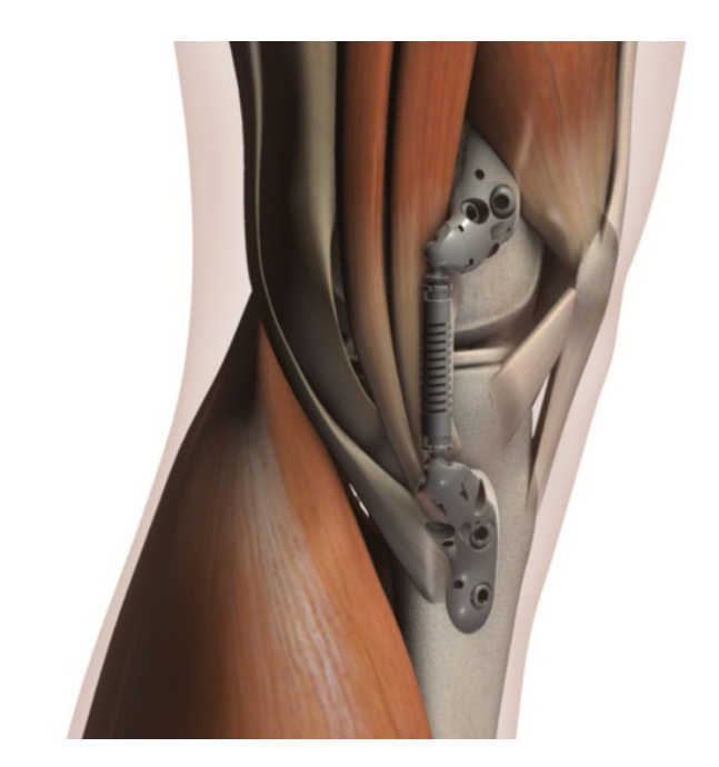
Figure 1. The KineSpring System, medial view.

The KineSpring System is both extra-articular and extracapsular. Implantation of the device is achieved without resection of bone, muscle, or ligaments, and without violation of the joint capsule. The load absorber resides in the subcutaneous tissue on the medial aspect of the knee and is positioned superficial to the medial collateral ligament. Device implantation without joint invasion means that the option of future device explant remains, if needed, thereby leaving the joint in its pretreatment state.