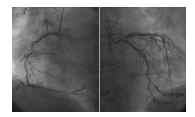
Figure 1. Coronary angiogram showing LMCA disease with severe ostial LAD stenosis and moderate proximal circumflex disease.

Coronary angiogram showed a significant LMCA disease with a diffuse narrowing estimated at 70%, a severe subocclusive ostial (>95%) LAD stenosis proximal to the stent (TIMI-1 flow), mild LAD intrastent narrowing and moderate (65%–75%) proximal circumflex artery disease with intrastent narrowing but patent stent. In addition, there was a moderate lesion on mid right coronary and severe stenosis on distal right coronary artery (Fig. 1). The coronary