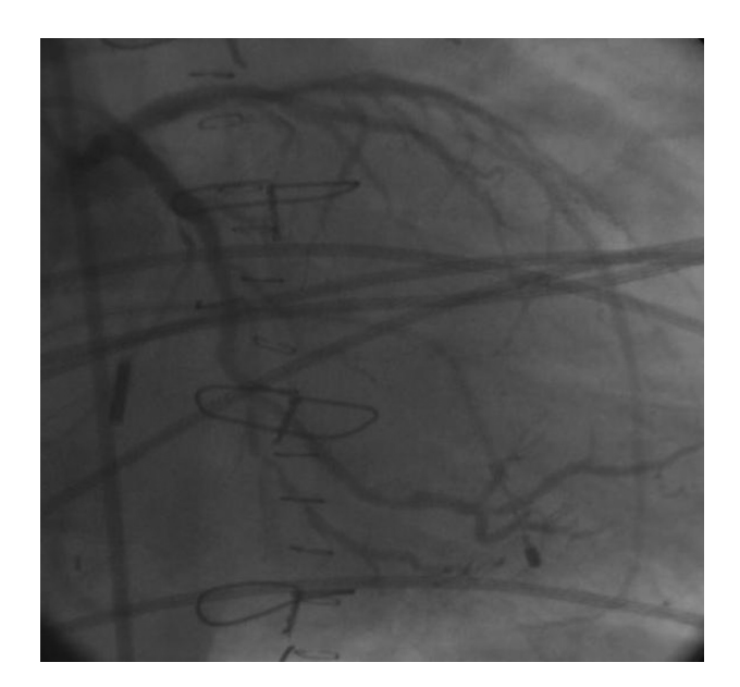
Figure 3. PCI of LMCA, proximal LAD and proximal circumflex.

condition with blood pressure at 90/60 mm Hg, and an acceptable diuresis of 35–40 cc/hour. PCI was delayed due to the critical hemodynamic status, nevertheless it was successfully performed 18 hours later. It consisted of LMCA, proximal LAD, and proximal circumflex angioplasty/stenting (Fig. 3) using T-stenting technique (Everolimus drug eluting stents) with end kissing balloon angioplasty. Over the next 48 hours, the patient's hemodynamic condition progressively improved and stabilized, positive inotropic drugs were progressively withdrawn, intra aortic balloon was removed, and the patient