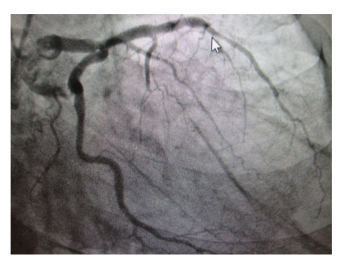
Figure 3. Coronary angiogram showing an occluded mid left anterior descending artery.

artery disease (CAD) with an occluded mid LAD coronary artery.