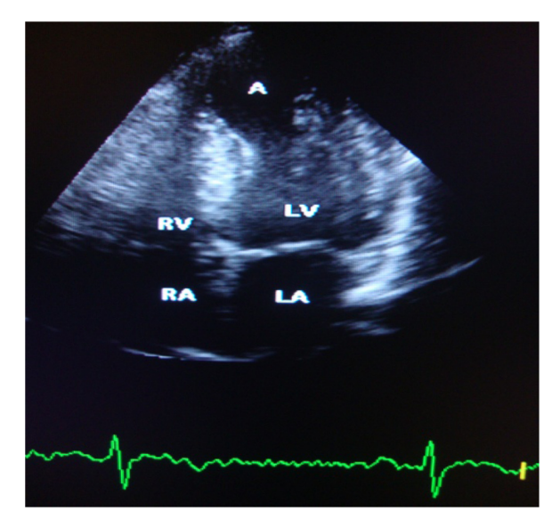
Figure 2. Apical four chamber view demonstrating the apical aneurysm (A).

Diagnostic catheterization (Fig. 3) was only accessible after one week of admission and it revealed a 30% distal stenosis of the left main coronary artery, as well as significant occlusion of the left anterior descending (LAD) coronary artery in the mid segment with collaterals from the right coronary artery. The left circumflex coronary artery was normal and nondominant while the right coronary artery (RCA) was normal and dominant. Left ventriculography was not done in view of the LV apical thrombus. The renal arteries were normal and bilateral. In summary, the angiogram showed significant single vessel coronary