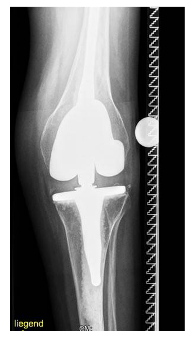
Figure 9. Recently a total knee prosthesis was implanted (LCCK), healing occurred without complications. Mobilization afterwards was very slow, the patient used a wheelchair because of instability in the anklejoints, arthritis and instability in the left knee was evident.

Congenital anomalies of the cardiovascular system, such as septal defects, valvular anomalies, and vascular hypoplasia as well as the acquired pathology of dilatation of the ascending aorta and dissecting aortic aneurysm, are serious complications of the disease.<sup>1,7,12</sup> The pathological mechanism by which mutation in FBN1 fibrillin-1 encoding gene predisposes to the constellation of the musculo-skeletal abnormalities encountered in Marfan Patients is mostly based on the presence of fibrillin-1 mutation gene in cartilage, periosteum, and skin. Fibrillin-1 gene in the cartilage, results in various abnormalities, namely developmental dysplasia of the hip and protrusio acetbulae and other weight bearing zones abnormalities.<sup>6</sup> In addition, the presence of a