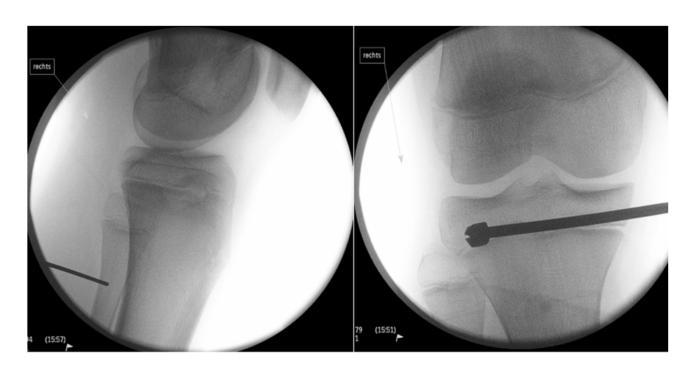
Figure 4. A 15-year-old male patient presented with a limb length discrepancy of 41 mm. A permanent epiphysiodesis with drilling has been applied based on Canale.

Reformatted CT scan showed the progressive deformation of the thoraco-lumbar vertebrae in a patient with Marfan syndrome, there is loss of the normal vertebral concavity associated with progressive antero-lateral growth reduction with exaggeration of vertebral flattening associated with the development