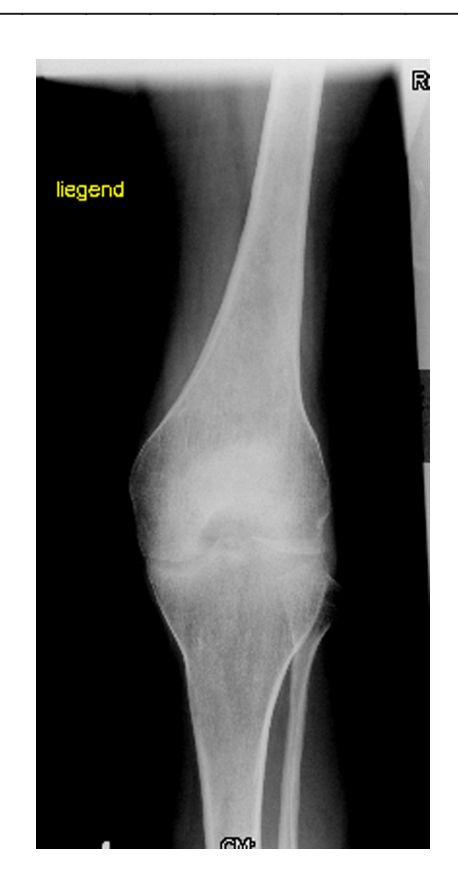
Figure 8. AP radiograph of the knee showed severe osteoarthritis matching the grade of II–III of Kellgren-Lawrence grading scale. Note the flattened and dysplastic epiphyses associated with a marked narrowing of the joint spaces, sclerosis and subsequent deformity of the bony contour, the patient started to walk with crutches. The knee was unstable medial and lateral +++, patella was sub-luxated to the lateral and medial side, atrophy of the quadriceps muscle was evident, the MRI indicated an infarction-area in the distal femur.

Marfan syndrome is caused by a defective gene FBN1, located on the long arm of chromosome 15. This gene encodes for fibrillin-1, a large glycoprotein closely associated with elastin. In addition to their presence in the aortic media and suspensory ligaments of the lens, fibrillin microfibrils are found in skin, tendon, cartilage, and periosteum. In contradistinction, the much rarer Beal's syndrome is caused by the defective gene FBN2, located on chromosome 5 that encodes for the glycoprotein fibrillin-2.