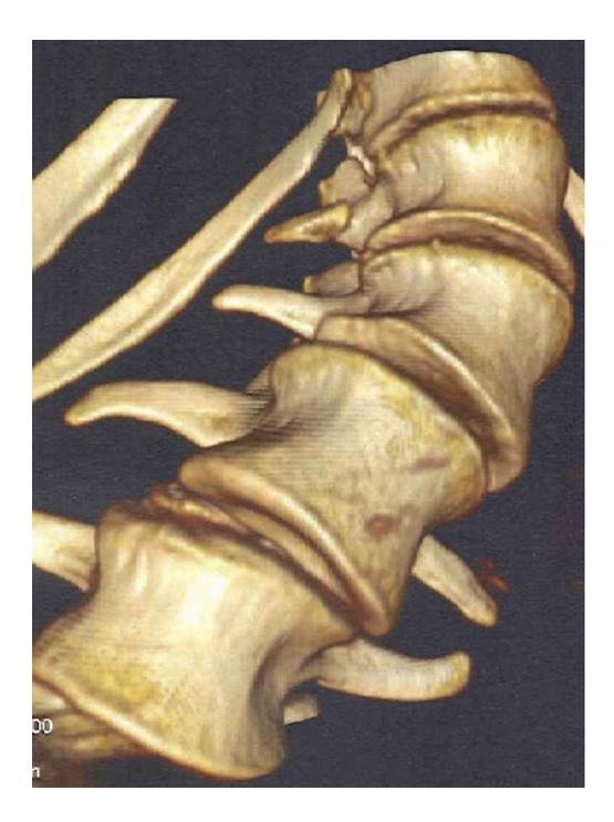
Figure 6. Reformatted CT scan showed the progressive deformation of the thoraco-lumbar vertebrae in a patient with Marfan syndrome, there is loss of the normal vertebral concavity associated with progressive antero-lateral growth reduction with exaggerated vertebral flattening associated with the development of marginal deformity (arrow) T12, L1-2 (bony outgrowths of the vertebral column) which are suggestive of spinal arthritis secondary to progressive degeneration with subsequent development of end-plate abnormality and or destruction.

of marginal osteophytes (arrow) T12, L1-2 (bony outgrowths of the vertebral column) which are suggestive of spinal arthritis secondary to progressive degeneration with subsequent development of endplate abnormality and or destruction. Ligamentous laxity is also a cause of the precocious axial and extra-axial osteoarthritis in Marfan syndrome (Fig. 6). Because of an insufficient bending in the preoperative radiographs, the operative procedure was planned in two steps. First, a ventral release was done at the level