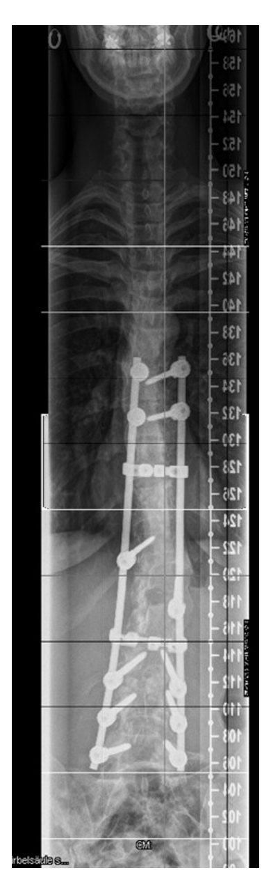
Figure 7. The operative procedure was planned in two steps, because of an insufficient bending in the preoperative radiographs. First, a ventral release was done at the level L1/L2, L2/L3 and L3/4. 7 days later, the dorsal fusion with instrumentation of L5, L4, L3, Th 8, Th 9 with screws in every pedicle and a single screw on L1 (convexity) a Th 12 (concavity) was performed, and fixated on the bar in the right position. After neuro-logic control in anesthesia the fusion was prepared by inserting autologous bone and osteoinductive bone substitute.

L1/L2, L2/L3 and L3/4. Seven days later, the dorsal fusion with instrumentation of L5, L4, L3, Th 8, Th 9 with screws in every pedicel and a single screw on L1 (convexity) and Th 12 (concavity) was performed, and fixation of the bar in the right position was done. After neurologic control in anesthesia, the fusion was prepared by inserting autologous bone and osteoinductive bone substitute (Fig. 7).