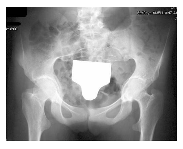
Figure 2. AP radiograph of the hips in a 33-year-old patient with Marfan syndrome showed protrusio acetabuli in which there is abnormally positioned acetabulae associated with severe osteoarthritis.

Leg length inequality in children is a frequent parental concern or physical finding noted by the orthopaedist.<sup>8</sup> Asymptomatic leg length inequality is relatively common in the healthy paediatric and adult population.