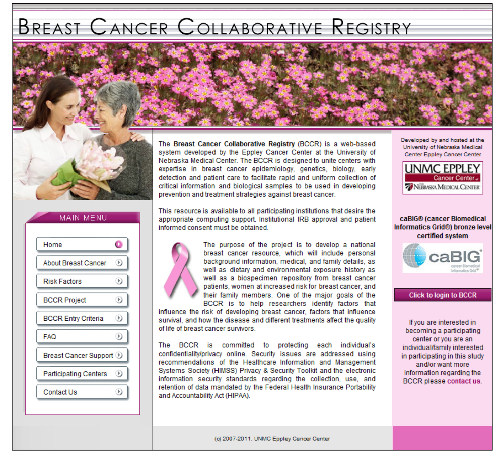
Figure 2. The BCCR website.

The BCCR user interface is compatible with all major web browsers, such as Microsoft Internet Explorer 6+, Mozilla Firefox 3+, Opera, and Safari. The user interface and data collection forms were designed to eliminate ambiguity and to assist in accuracy and ease of data collection by providing predefined selection of choices whenever possible. The BCCR system includes validation components that prevent entering erroneous information by the users. The BCCR developers regularly collect feedback