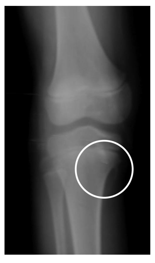
Figure 4. Knee joint X ray of 11 year old son, showing ovoid sclerotic lesions in distal end of Tibia and Fibula. Circle indicates an exostosis in medial aspect of Tibia.

symmetrically distributed within epiphyses and metaphyses of long bones. These lesions appear as dense radiopaque spots.<sup>6</sup> In the current study, pelvic X-ray showed multiple oval shaped radiodensities of various degrees on the upper heads of femur, acetabulum and symphysis pubis.