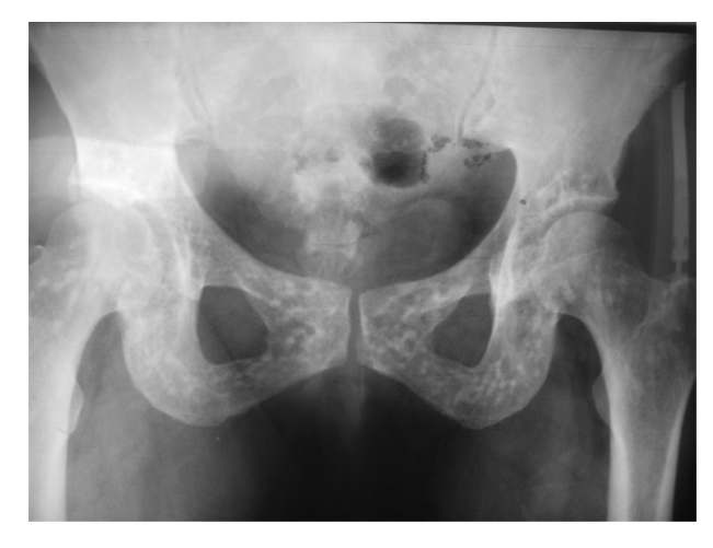
Figure 1. X ray of the patient pelvis, showing multiple symmetric and sclerotic lesions.

This current report presents a 46 year old female patient and her son and daughter diagnosed with OPK. An epidemiologic study on 53 patients affected with OPK indicated that the frequent sites for OPK, were phalanges (100%), carpal bones (97.4%), metacarpals (92.5%), foot phalanges (87.2%), metatarsals (84.4%), tarsal bones (84.6%), pelvis (74.4%), femur (74.4%), radius (66.7%), ulna (66.7%), sacrum (58.9%), humerus (28.2%), tibia (20.5%), and fibula