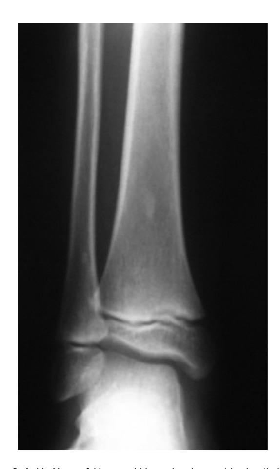
Figure 3. Ankle X ray of 11 year old boy, showing ovoid sclerotic lesions in distal end of Tibia and Fibula.

Characteristic radiologic signs of OPK consist of numerous 2–10 mm ovals or round shaped densities,