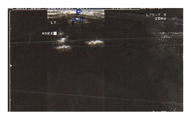
Figure 1. Ultrasound of the right knee joint (ventral longitudinal scan of suprapatellar pouch) showing normal knee synovial thickness. Note that no effusion is detected. Abbreviations: P. patella: FH. femoral head.