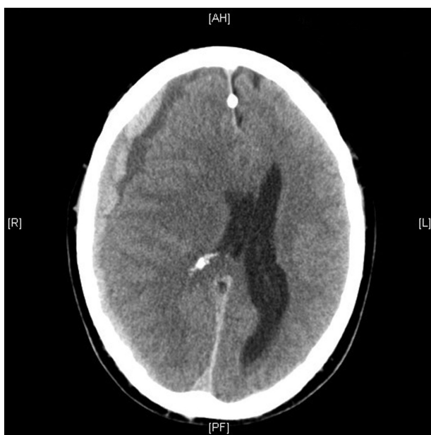
Figure 1. Computed tomography indicated a large right-sided acute on chronic subdural hematoma (maximum depth, 1.9 cm) occupying the frontal, parietal and temporal convexities, and a possible small subarachnoid hemorrhage.

Before surgery, rapid reduction of the INR is required (normalized INR is \leq 1.3 ). In line with current guidelines, the protocol in our hospital is to use Beriplex® P/N to achieve this and stop bleeding in patients taking OAT. Approximate dosing of Beriplex® P/N can be calculated based on patient bodyweight, the INR before treatment, and the target INR. Resuscitation nurses at our hospital are trained in the administration of Beriplex® P/N—familiarity of nurses and hematology staff with the protocol