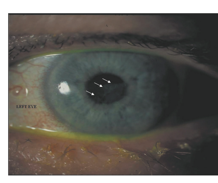
Figure 2. Corneal scarring of the left eye (white arrows), consistent with resolution of the corneal ulcer.

steroids and methotrexate, demonstrated chronic skin lesions and experienced recurrent skin involvement, and there was no reason to challenge the diagnosis of cutaneous sarcoidosis.