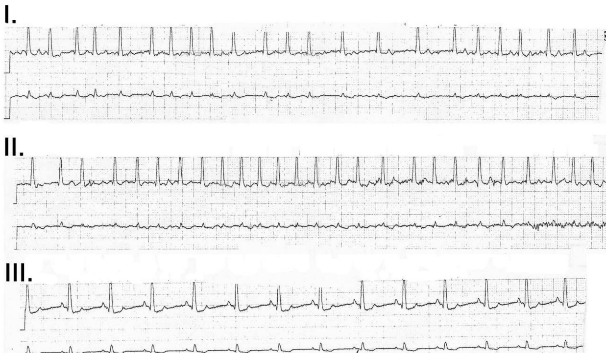
Figure 2. The telemetry strip recording of Lead II for the 29-year old male before (panels I and II) and after (panel III) the digital rectal exam.

The patient was also told to strain during the rectal guiac exam, causing increased vagal tone