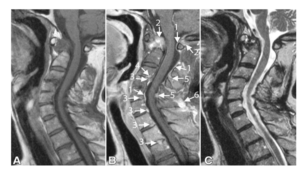
Figure 2. Sagittal fast spin-echo MRI of the cervical spine in an RA patient (a 51-year-old woman who had suffered RA for 31 years) with superficial and deep enhancement. A ) (T1-weighted) and C - (T2-weighted) images show; stenoses at levels C1–2 and C3–4, mostly caused by pannus and subluxation at level C1–2 and by discopathy and ligamentum flavum hypertrophy. B ) (gadolinium-enhanced T1-weighted image) shows; superficial enhancement lining the cerebrospinal fluid (arrow 1) and enhancement involving deeper structures. Deep enhancing tissue is recognized as bone and pannus tissue on C1–2 (arrow 2), as a disc on anterior levels (arrow 3), level C3–4 (arrow 4). Ligamentum flavum and interspinal ligaments are enhanced at the posterior levels (arrow 5). Deep enhancement coincides mostly with narrowing of the spinal canal at these levels. Note enhancement of the ligamentum nuchae (arrow 6).

associated with an average increase in total sharp score. Interestingly, they found that a positive anti-MCV test was associated with boney erosions rather than joint space narrowing (cartilage damage). However, positive anti-CCP was associated with joint space narrowing.